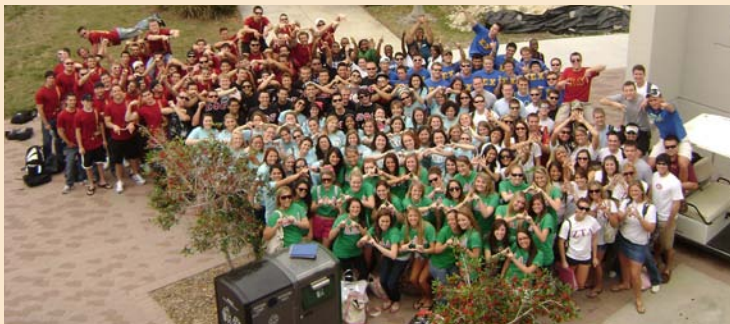
Greek Week, February 22-25, 2010.

10% of our Greek Community is involved in primary leadership roles outside of their individual organization. Getting involved in a Greek letter organization fosters involvement by encouraging members to participate in other leadership opportunities throughout the FGCU community. Using networking skills and leadership training they have gained within their sorority or fraternity, our Greeks encourage members to expand their college experience by getting involved with other student organizations. Involvement cultivates more involvement which enhances connection to their organization and the university as a whole.