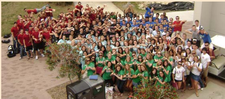
Greek Week, February 22-25, 2010.

10% of our Greek Community is involved in primary leadership roles outside of their individual organization. Getting involved in a Greek letter organization fosters involvement by encouraging members to participate in other leadership opportunities throughout the FGCU community. Using networking skills and leadership training they have gained within their sorority or fraternity, our Greeks encourage members to expand their college experience by getting involved with other student organizations. Involvement cultivates more involvement which enhances connection to their organization and the university as a whole.