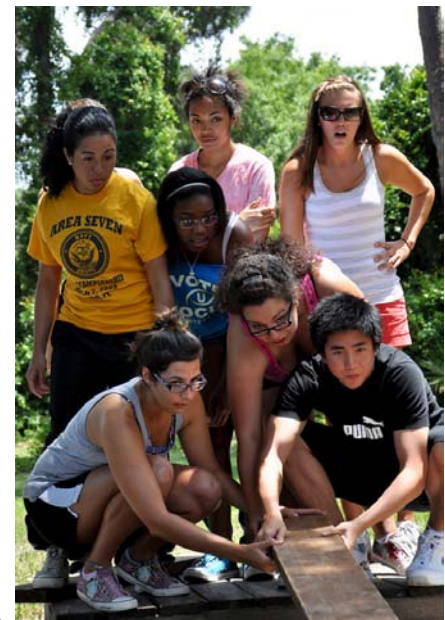
Multicultural Ambassadors doing a team building activity at the spring retreat, April 2011.

Multicultural Ambassadors are excited to offer their services to the university community for departmental events and classroom presentations.