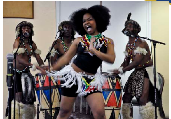
Umdabu South African Dance Theater performing at the Black History Month celebration, February 2011.